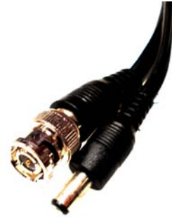
Camera End of Cable