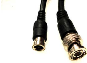
TV/VCR/DVR End of Cable

Unwrap the cables and separate the 2 ends of the cable.